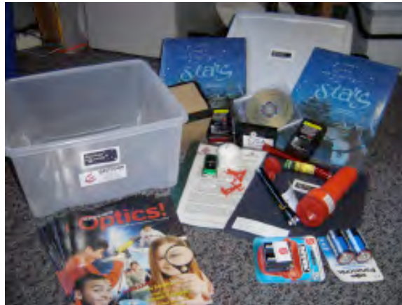
Figure 3. The Dark Skies activity kit

Future Dark Skies at EASTCONN plans include an ongoing study of the brightness of the nighttime sky with an ever-expanding group of students. In addition, in celebration of the Year of Astronomy, students will be making Galileoscopes in an online class. Dark Skies at EASTCONN is unique because students engage in authentic scientific study while also enhancing their global awareness through an international partnership and study of the nighttime sky. To date, two high schools, two colleges and four elementary schools in the US and their partner schools in have taken part in Dark Skies at EASTCONN.