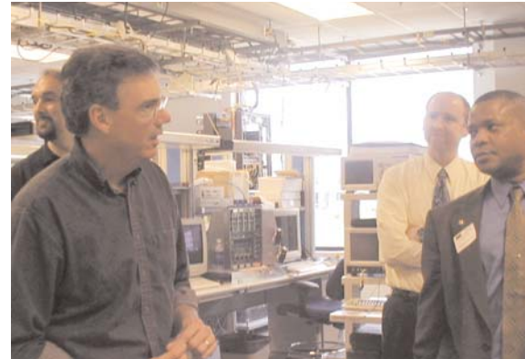
Participants at the Texas workshop visit Cisco Systems.

The PHOTON2 instructor team looks forward to another set of introductory workshops in the fall of 2004. Participants in this second cohort will take the web-based, one semester course "Introduction to Photonics" in the spring semester of 2005. ■