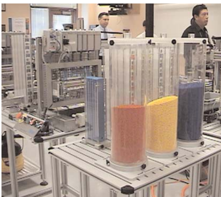
An HAS200 machine in the Pima semiconductor manufacturing lab. The machine, sponsored by Intel, simulates processes that take place in a semiconductor factory.

"[Since] not that many community colleges in the U.S. are teaching optics," he said, "[PHOTON2] seemed like a good way to network" with like-minded educators.