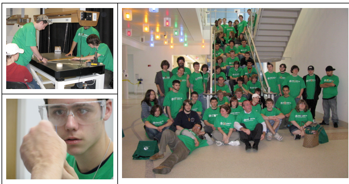
Fig. 4 Expanding Horizons: Plainfield students with others at TRCC Laser Camp 2009

The next time at Three Rivers, all four of the participating schools were there at the same time (so we got a group photo). This time, so many kids were involved that we had to have six activities going at once, of which each student got to do three (a logistical nightmare, had not Judy had the forethought to have them put in their requests ahead of time, then prepare a master schedule giving everyone at least their number one choice). Judy, her staff, her students (and SPIE student chapter members), and EASTCONN staff all were kept busy, while we teachers moved back and forth among the commotion (amazingly minor, for all that activity), snapping photographs and listening to dialogue. Everyone had fun, learned something, met someone new, and got something to take home for “show-and-tell.” I even picked up a telescope that TRCC was discarding that Judy had offered to pass on to our astronomy club.