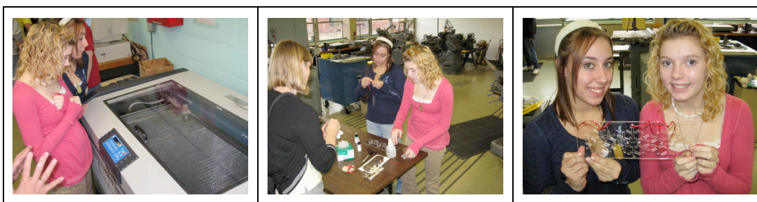
Fig. 1 PHS students make and decorate laser-engraved Christmas ornaments at TRCC

Once school started, in August 2007, my photonics class got pushed to the back burner, since I was not teaching it at all that year, and my number one task in addition to the classes that I did teach was to prepare a teaching portfolio for submission to the CT SDE as part of the evaluation procedures for beginning teachers (the Beginning Educator Support and Training Program, BEST). Needless to say, getting that career milestone completed satisfactorily was weighing heavily on my mind for almost that entire school year. Additionally, the school now had a new principal, and we were also beginning preparations for our ten-year re-accreditation process, so there were other challenges I needed to meet as well. But always in the back of my mind was the burning question of how could I better teach my photonics course the next time around (wondering, as well, if there was even going to be a next time).